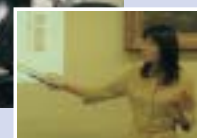
Lecture on energy conservation