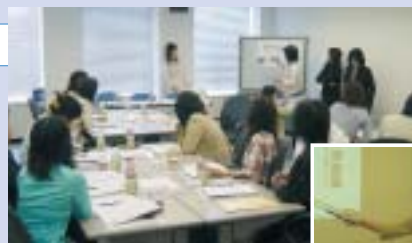
Eco Mothers meeting (April 17th, 2004)