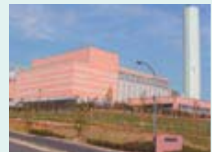
The Tobu Plant

Building of EMS began during construction of the plant itself in order to ensure effective protection of the environment, and the Tobu Plant acquired ISO14001 certification in March 2006.