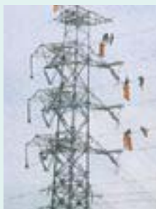
Wind noise reduction work on 220 kV transmission lines

Under its environmental policy, Kyuken practices environmentally considerate construction, such as minimizing construction noise and vibrations, and disposing of construction by-products appropriately.