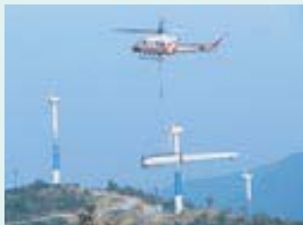
A Bell 412 helicopter

NISHI NIPPON AIRLINES' environmental philosophy, policies and objectives have been brought into line with those of the Kyushu Electric Power Group, and the company places emphasis on meeting its environmental targets, which, given the nature of its operations, include aircraft noise and fuel management.