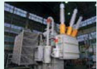
The transformer production line

As a manufacturer, KYUHEN not simply concerned with quality. Through its comprehensive business activities—including the environmental aspects of creating products—the company also follows an aggressive environmental management policy with the aim of achieving quality-centric management, which is one of main KYUHEN's corporate philosophies, while simultaneously contributing to a sustainable society. Through such efforts, KYUHEN aims to become a company that is trusted by its customers.